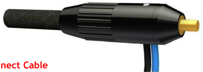
Coaxial Interconnect Cable

Gas, Power and Control cable in one heavy duty one piece easy to connect coax cable.