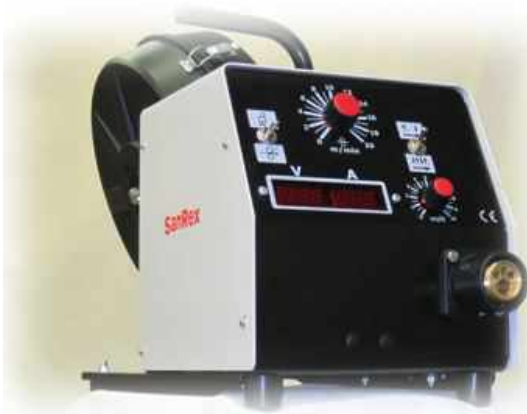
SANFEED SKY 4 & 4HD