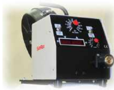
SANFEED SKY 4 & 4HD